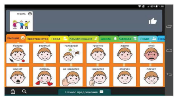
Fig. 3. "DAR Communicator"

High-tech assistive devices. Apps for smartphones and tablets "Communicator DAR". "Communicator DAR" was developed by Belarusian specialists for children and adults with autism. This software uses an alternative way of communication based on pictures, as a result of which even people who do not speak can express their desires, understand what is expected of them, develop language and successfully interact with other people. The program allows you to use graphic symbols (pictures) for communication, understandable to any person. Each image denotes a concept (emotions, movements, etc.) and has a voice accompaniment. "Communicator DAR" can be used by children from three to four years old.